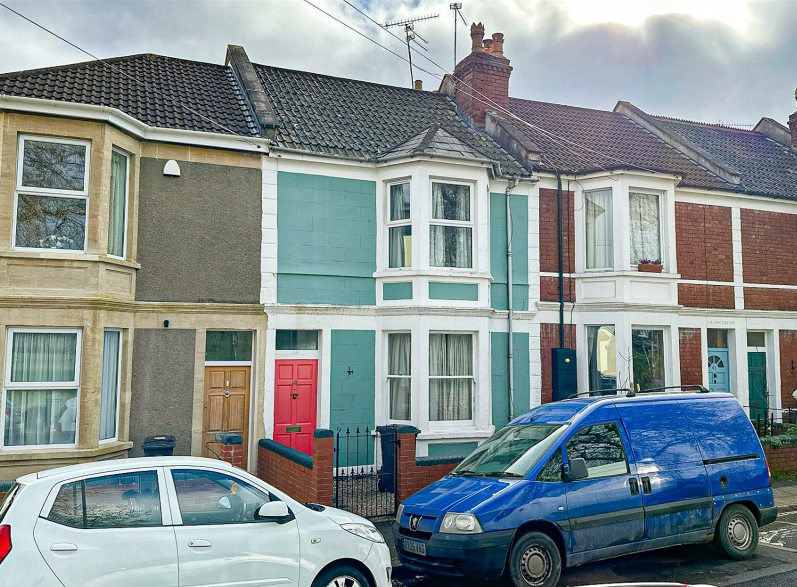
Hill Avenue, Bristol